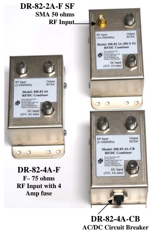
Figure 1: DR-82-4A